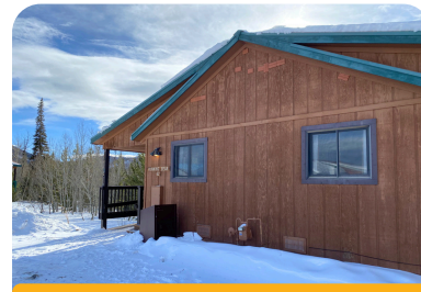
Running Bear #62

Starting in the high $300,000s 2 bed, 1 bath cabin with fireplace. Sleeps 5. Located on the ridge with easy access to winter and summer trails.