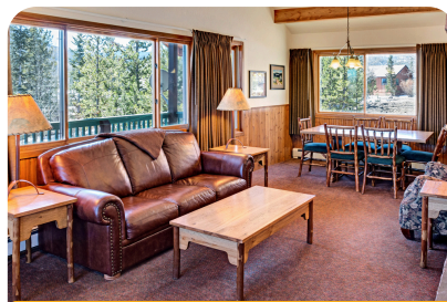
New Building Sites

Starting in the high $300,000s 2 bed, 1 bath cabin with fireplace. Sleeps 5. Located on the ridge with easy access to winter and summer trails.