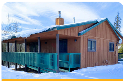
Little White Dove #63

Starting in the mid $400,000s 3 bed, 2 bath cabin with fireplace. Sleeps 7. Located on the ridge with amazing views to Lake Granby.