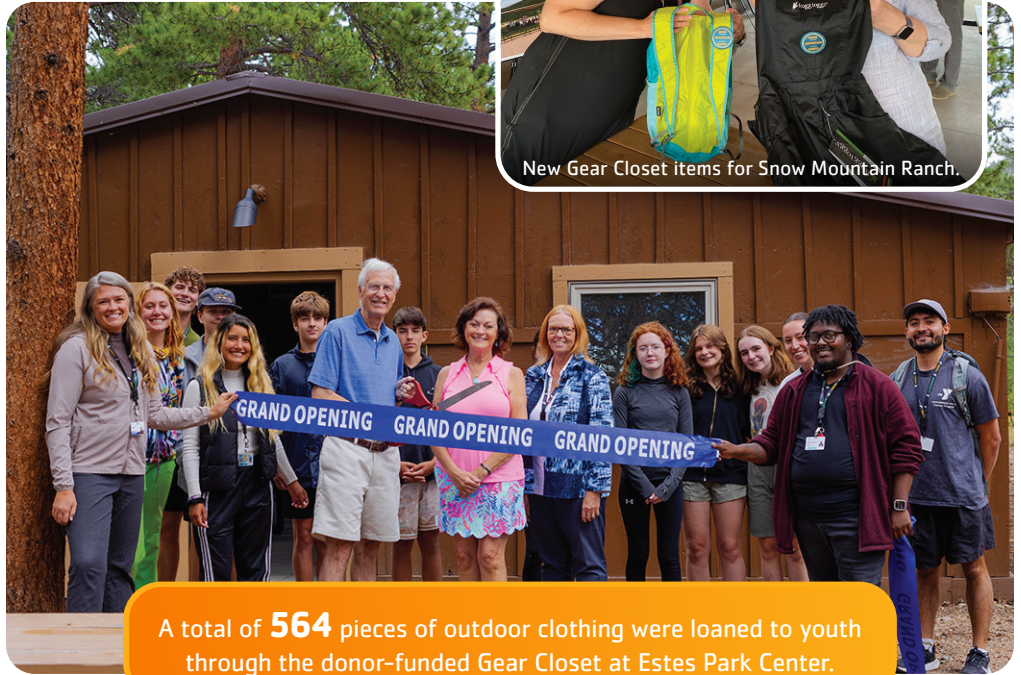
New Gear Closet items for Snow Mountain Ranch.