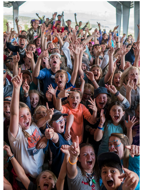
Camp Chief Ouray Campers

YMCA of the Rockies is a 501(3)(c) organization.